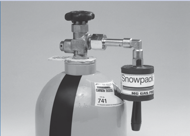
Liquid CO 2 must be used with Snowpack

Snowpack dry ice making equipment allows pellets of CO 2 dry ice to be made on the spot, wherever and whenever they are wanted.